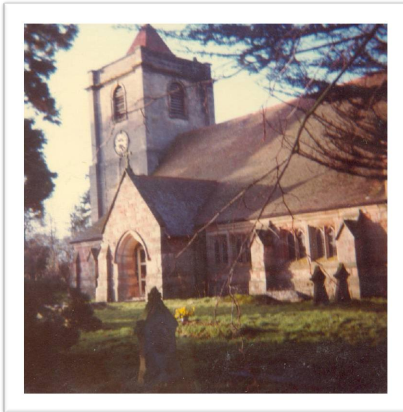
St. Michael's Church, West Felton, Shropshire

The church in West Felton, dedicated to St. Michael was founded in the 12 th century. The Norman work was destroyed probably during the Reformation Period. The South aisle was added just after the Norman Apse of the Sanctuary was destroyed. The choir and the Sanctuary area were added later and constructed of local sandstone. Very little original work is to be seen now. The church was much restored during the Victorian Period by Sir Giles Scott in the mock Gothic Style. Unfortunately the 17 th century stone and copper sundial was badly vandalised about 1979.