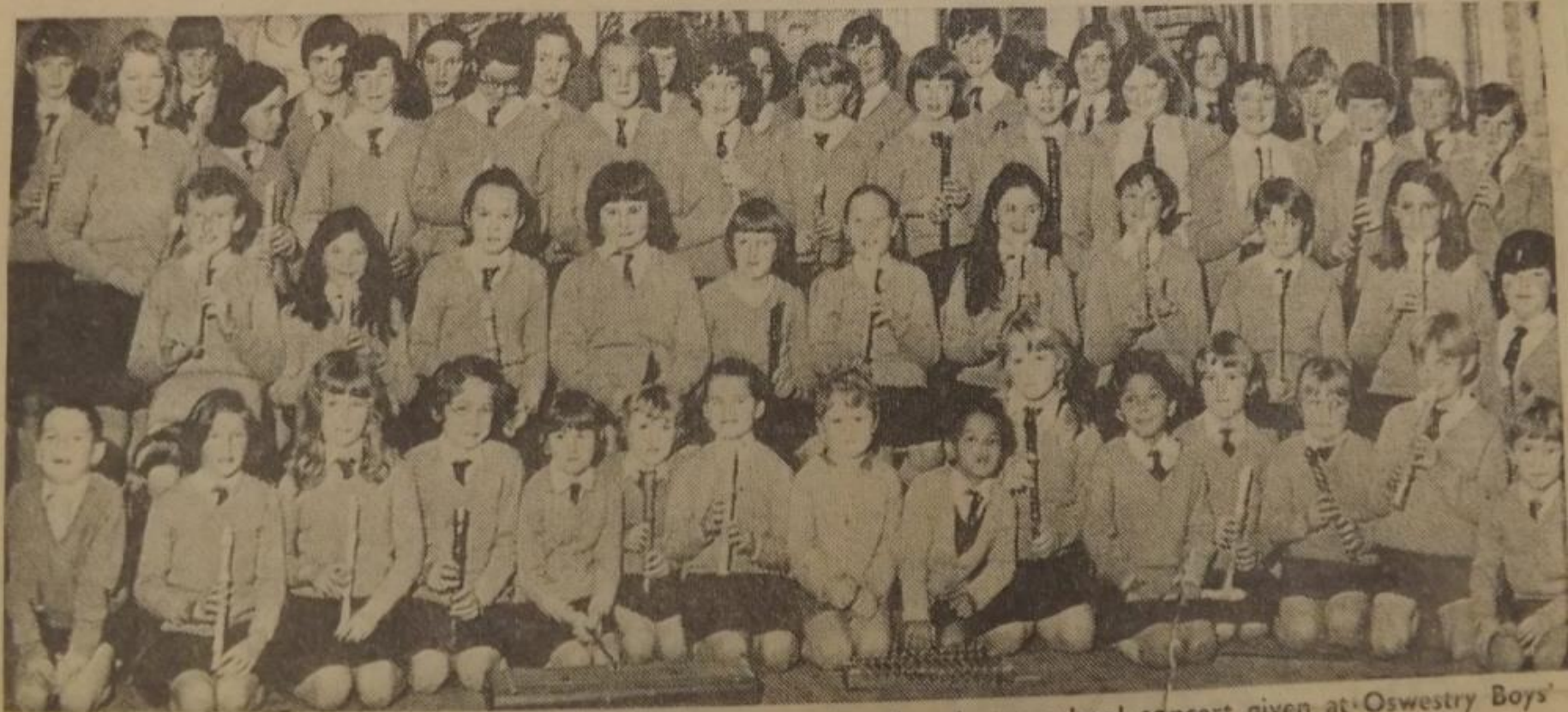
The recorder group of Queen's Park School, Oswestry, who played at a school concert given at Oswestry Boys' Modern School on Thursday.