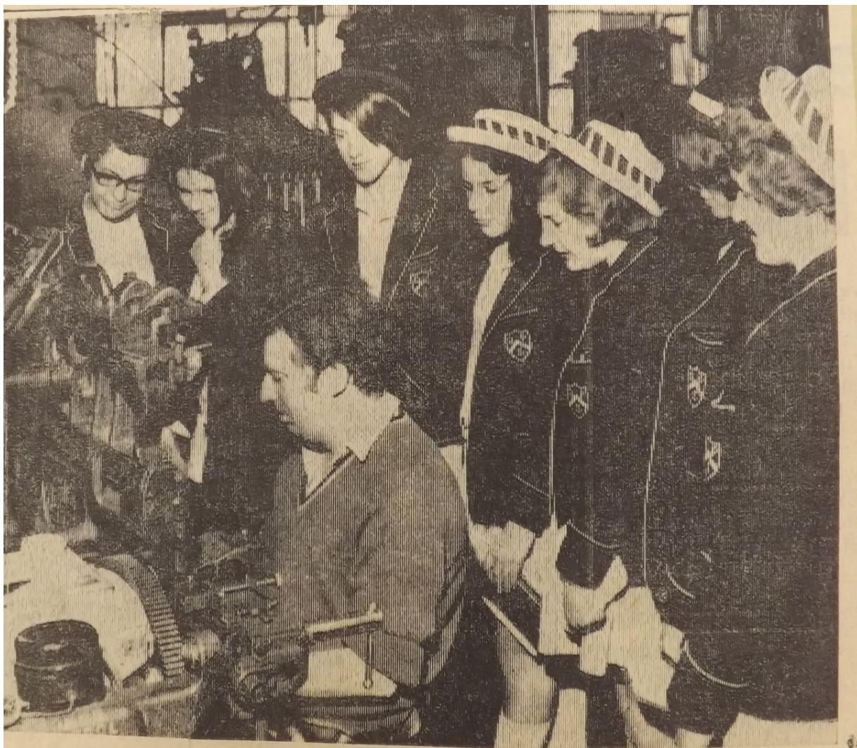
Pupils from Queen's Park School, Oswestry, visited Caxton Press on Thursday. They are watching a Linotype machine in action.