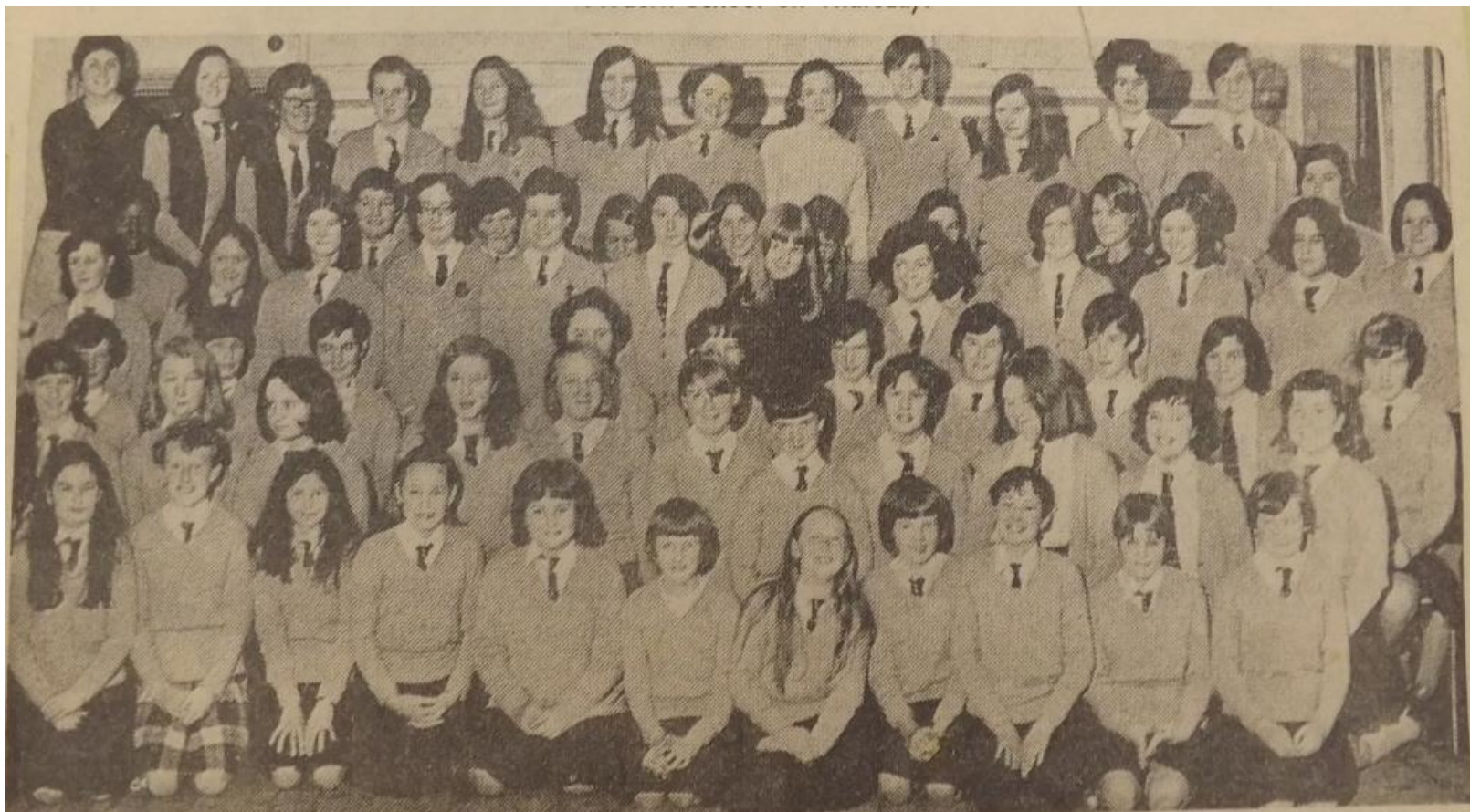
The choir of Oswestry Queen's Park School which took part in a concert in the Boys' Secondary Modern School on Thursday.