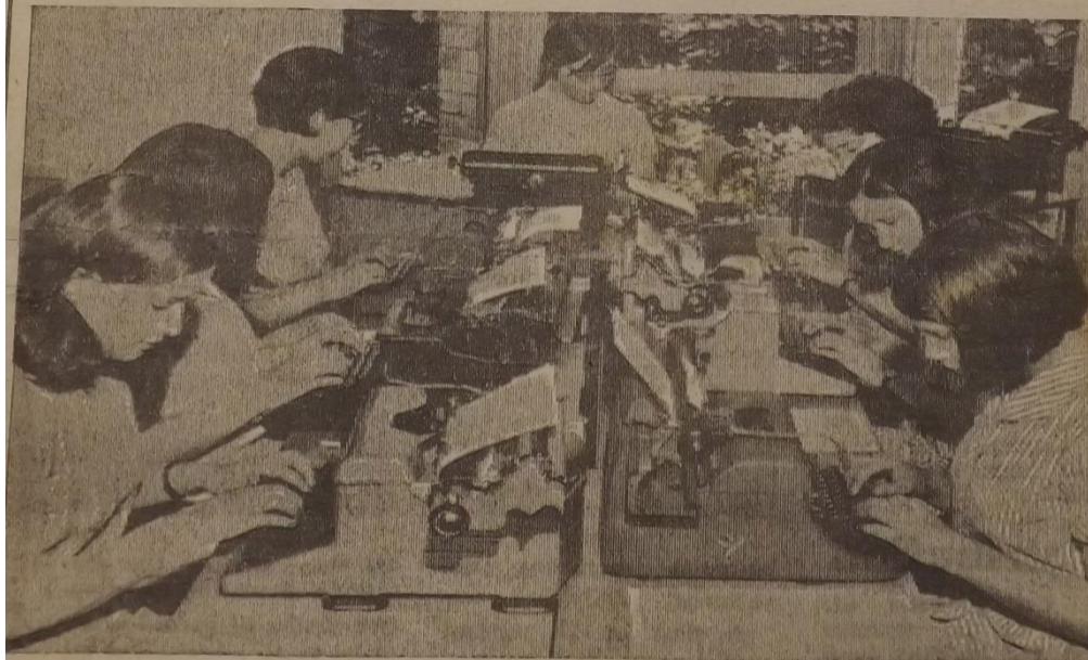
Typewriting is still one of the basic skills acquired by girls of Queen's Park School on the secretarial and finishing course. These girls are taking a preliminary course before they take part in the full course which starts next September.

Queen's Park hope by the end of their new course to turn out a young lady who knows what to wear, what to do and what to say for all business and social occasions and who will be equipped to command posts more responsible and interesting than just "working in an office"