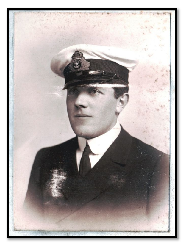
Lieutenant George Montford Drew H.M. Submarine E.14 Royal Naval Reserve Died 28<sup>th</sup> January 1918 Aged 25