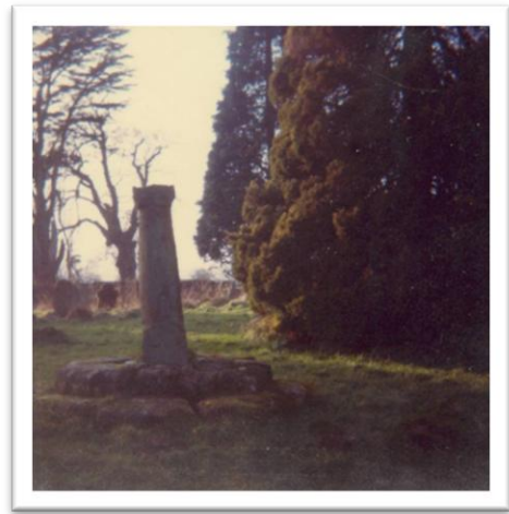
The 17 th Century Stone and Copper Sundial vandalised 1979.