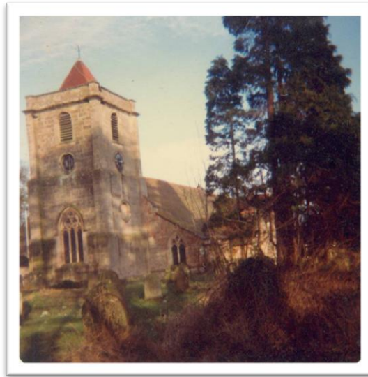
The Tower and part of Section B of the Churchyard Photographed in May 1984