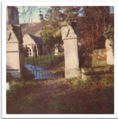
Main Entrance Gate recently replaced.