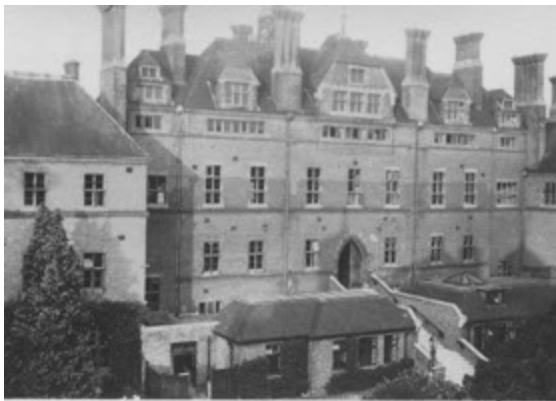
Main Building Front