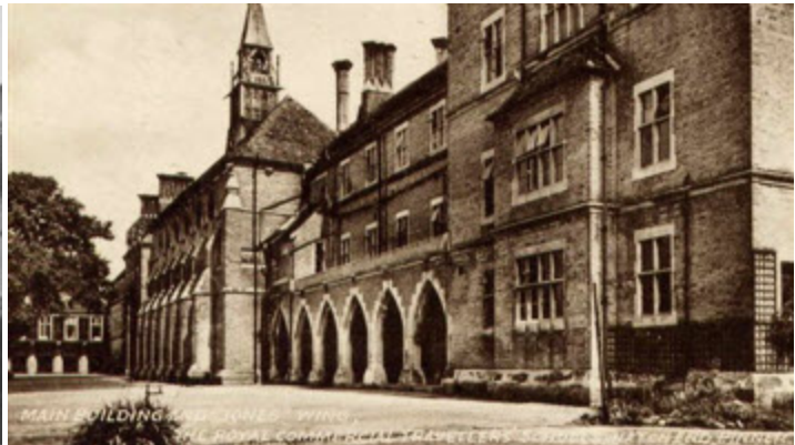
Main Building Rear