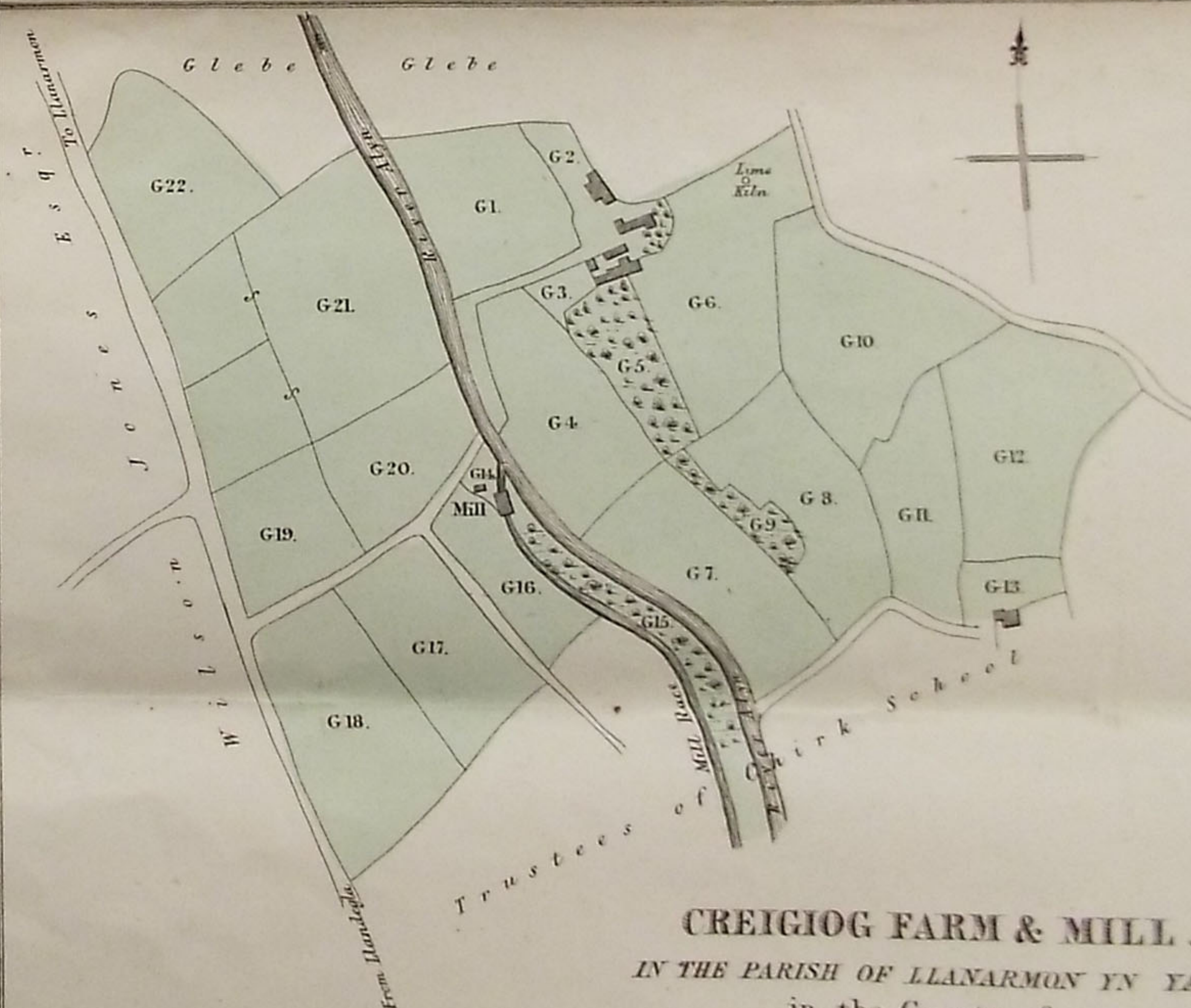
CREIGIOG FARM & MILL, IN THE PARISH OF LLANARMON YN YALE, in the County of DENBIGH.