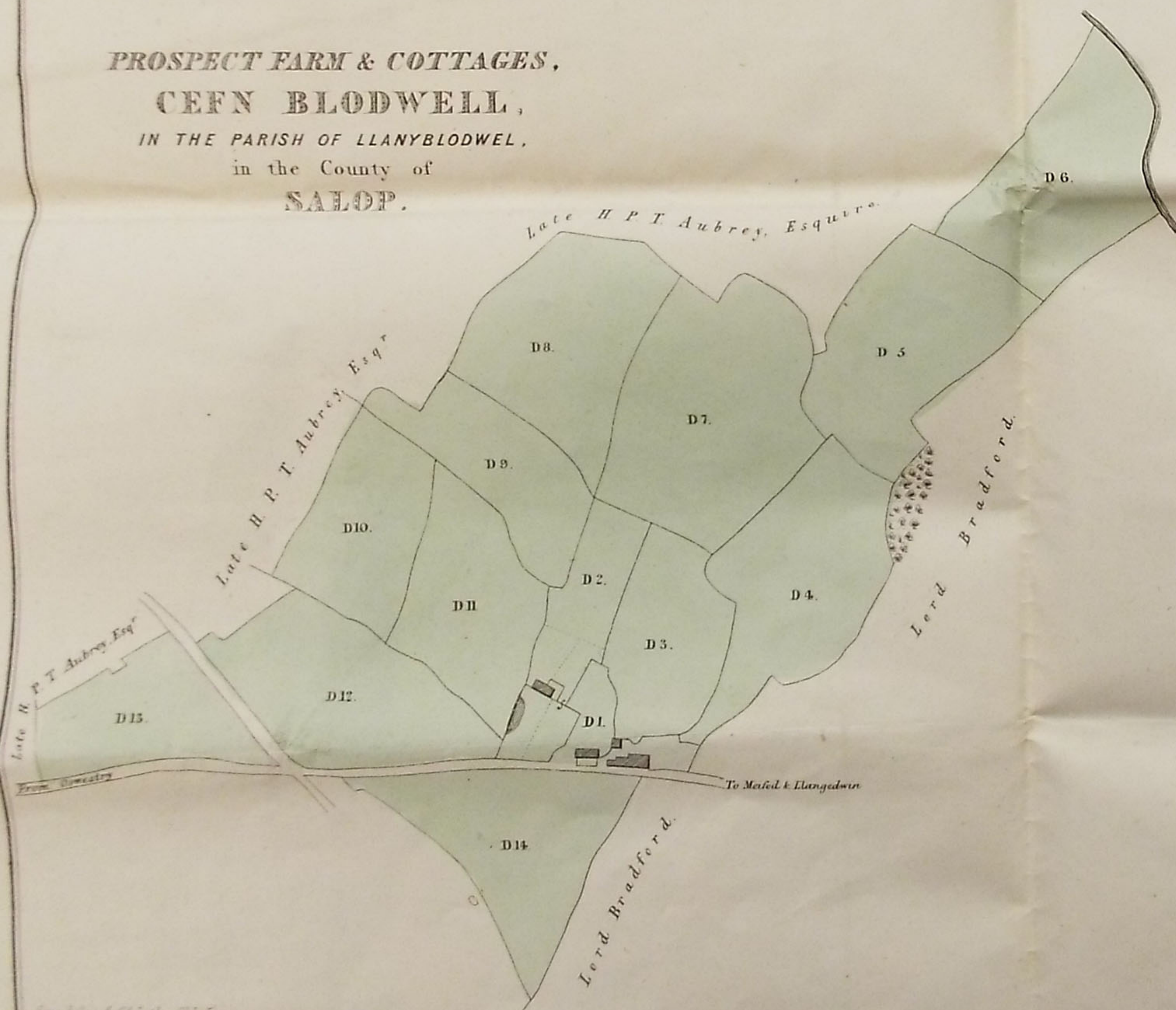
PROSPECT FARM & COTTAGES, CEFN BLODWELL, IN THE PARISH OF LLANYBLODWEL, in the County of SALOP.