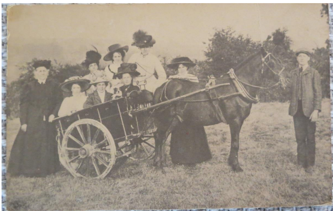
A Sunday Outing