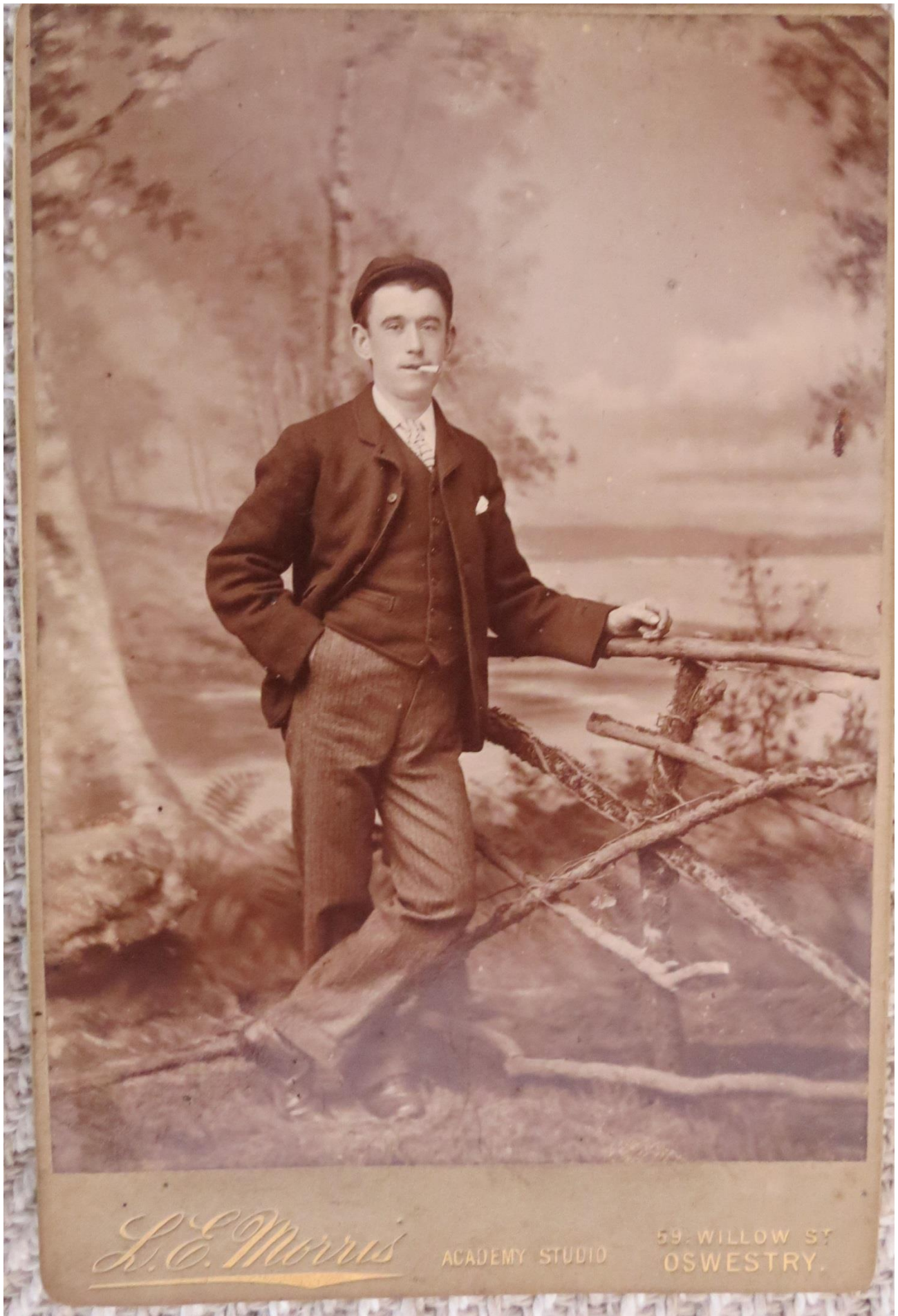
Edward Burnett JONES