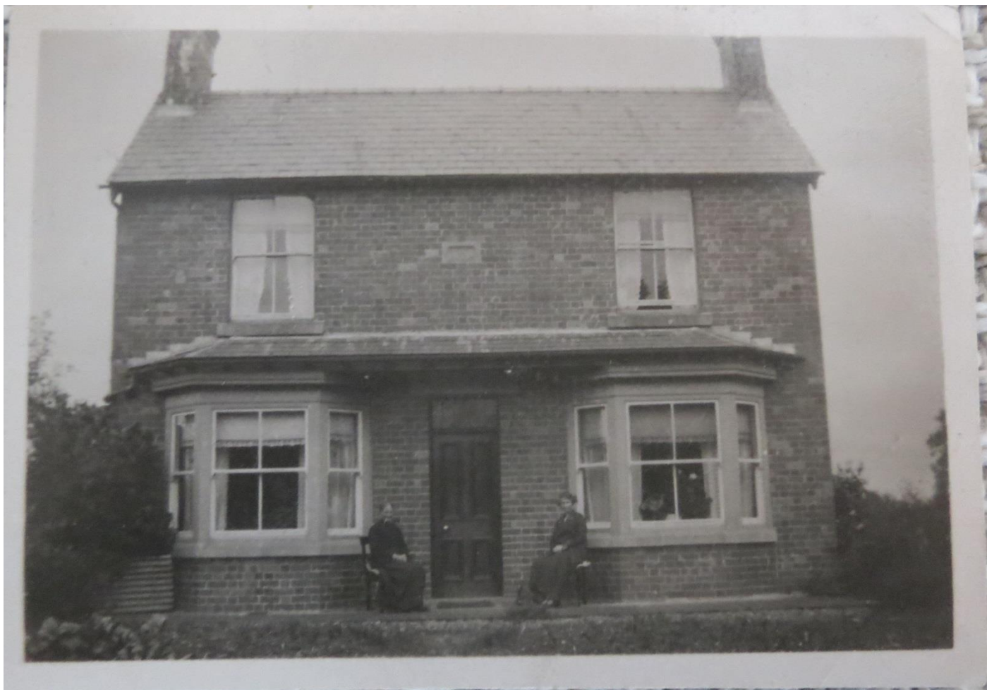
Unknown House in Kinnerley.