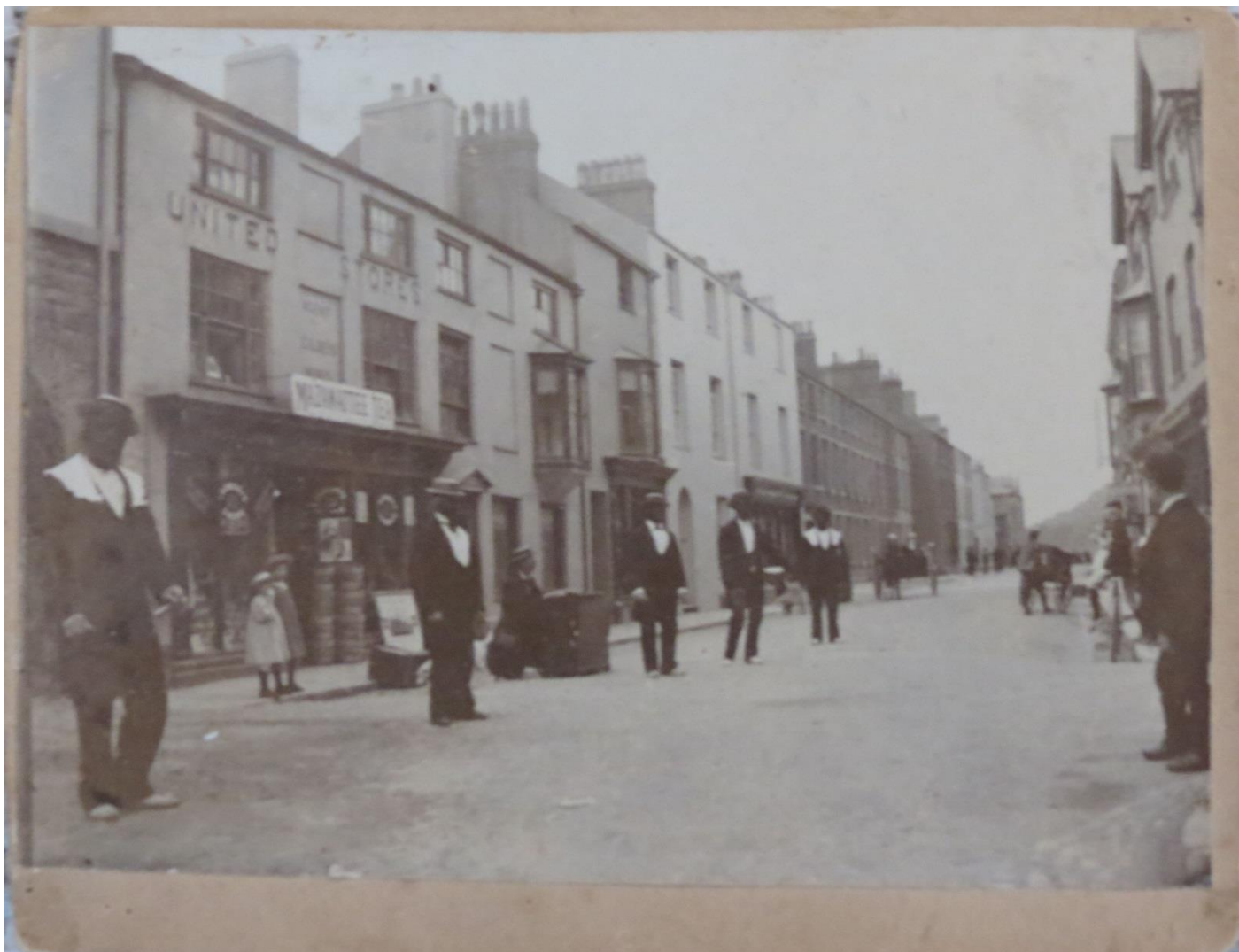
The Minstrels outside United Stores in Oswestry